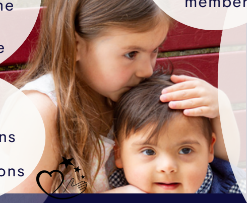
Down Syndrome Connection of the Bay Area Down Syndrome Support

Facilitated 100 Early Connections and Family Connections Groups